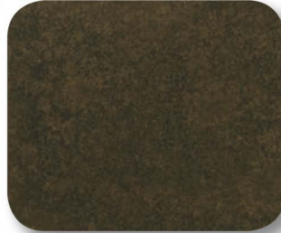
■ Golden Brown