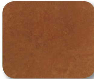
■ Satin Bronze